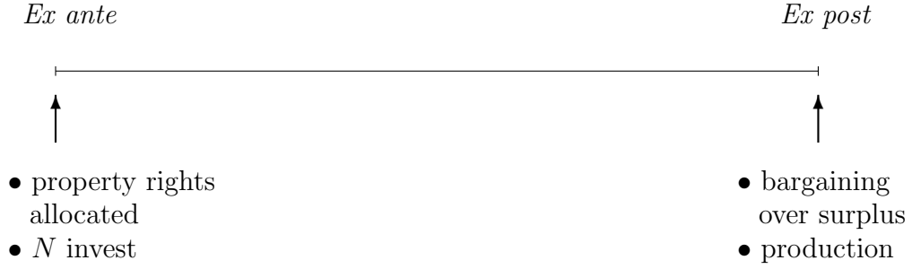
Figure 1: Simultaneous investment